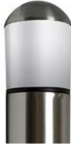
Opal Array Lens (OL)