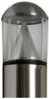
LED Cone Reflector (CR)